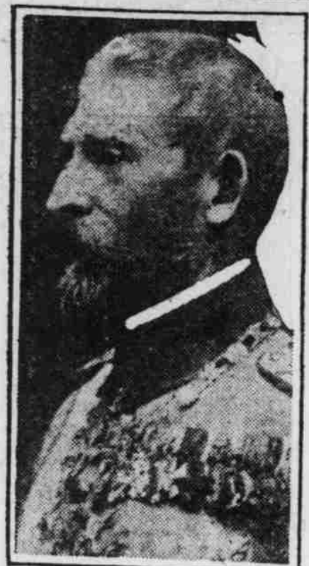
King Ferdinand of Roumania.

King Ferdinand, of Roumania, has given his consent to the marriage of his daughter, Princess Marie, to King Alexander, of Serbia. The wedding will take place in June.