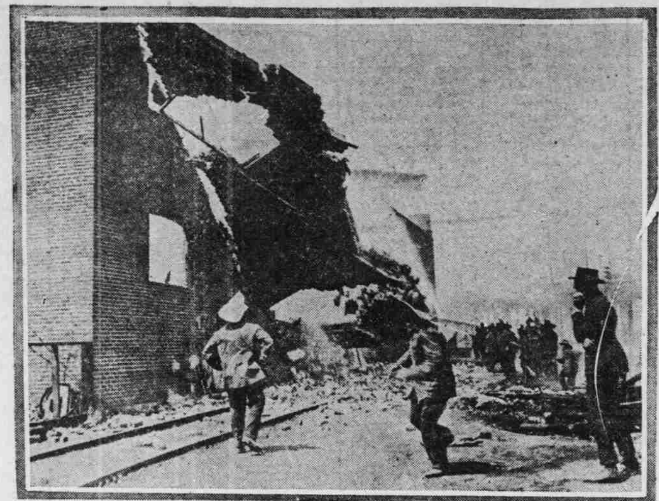
A remarkable photograph, taken during a fire in Los Angeles, Cal., several days ago, which caused damage amounting to over $250,000, showing one of the walls of the scarred building just as it collapsed. Five firemen were injured when the wall fell. The fire fighter seen in the foreground, wearing the white helmet, suffered a broken foot when a portion of the wall rebounded.