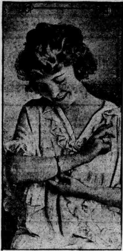
Even jewelry should be plain.

The market has been flooded recently with the most astounding amount of cheap, imitation jewelry. When I say cheap I do not mean cheap in price, for many of the so-called fashionable trinkets cost several dollars. I mean that the bulk of it is cheap in appearance.