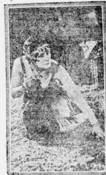
Allan Dwan presents "The Forbidden Thing"

Allan Dwan's first production for Associated Producers, tells the story of the conquest by true love of a man who had staked his all on false—a love engendered by sex attraction. It is laid mainly in a Cape Cod fishing community. James Kirkwood heads a large cast.