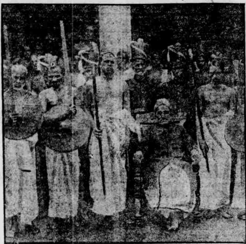
The Zamorin of Calicut (above), the metropolis of the Malabar coast region, and his body guard. The Zamorin is a Hindu potentate who figured largely in the wars of the Dutch, English and Portuguese after Vasco da Gama discovered Malabar. The present Zamorin is a peaceful citizen and president of the relief committee for Hindu refugees. Calicut is where the chief open rebellion has been engaging British arms.