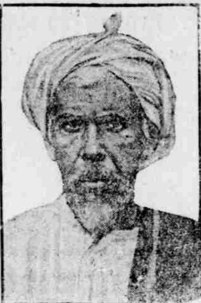
Chief Ali Musaliar, one of the Moplah rebel chiefs of the early days of the rebellion, who was captured and hanged.