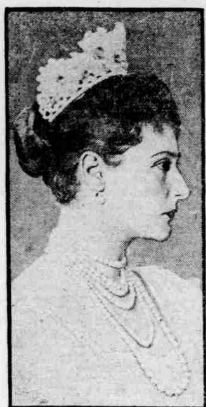
The $1,000,000 necklace as worn by the Empress of Russia.