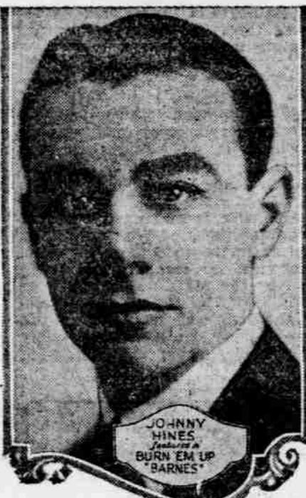
JOHNNY HINES "BURN 'EM UP BARNES"