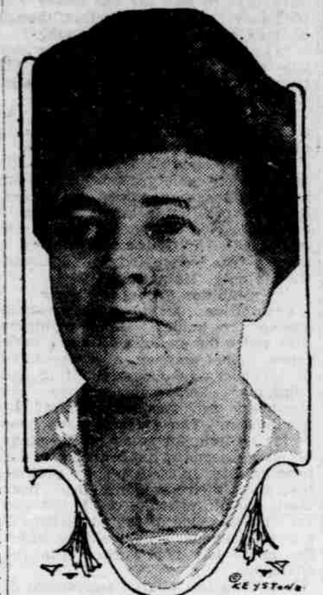
MRS. O. H. P. BELMONT.