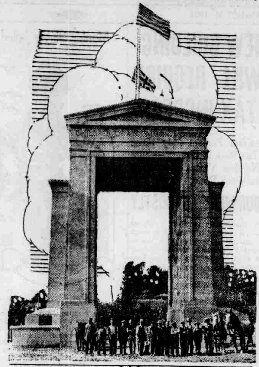
Picture of world's first peace arch taken from American side, with workman who built the portal in the foreground.

The world's first peace arch is to be opened in September and dedicated to the never broken friendship between the United States and Canada. The simple portal is built on the international boundary between the two countries, at Blaine, in Washington, and White Rock, in British Columbia, within one hundred yards of the Pacific ocean. The arch will commemorate the one hundred years of peace along the 2,500 miles from the Atlantic to the Pacific where there has been no need for battlements, forts or sentries for 107 years.