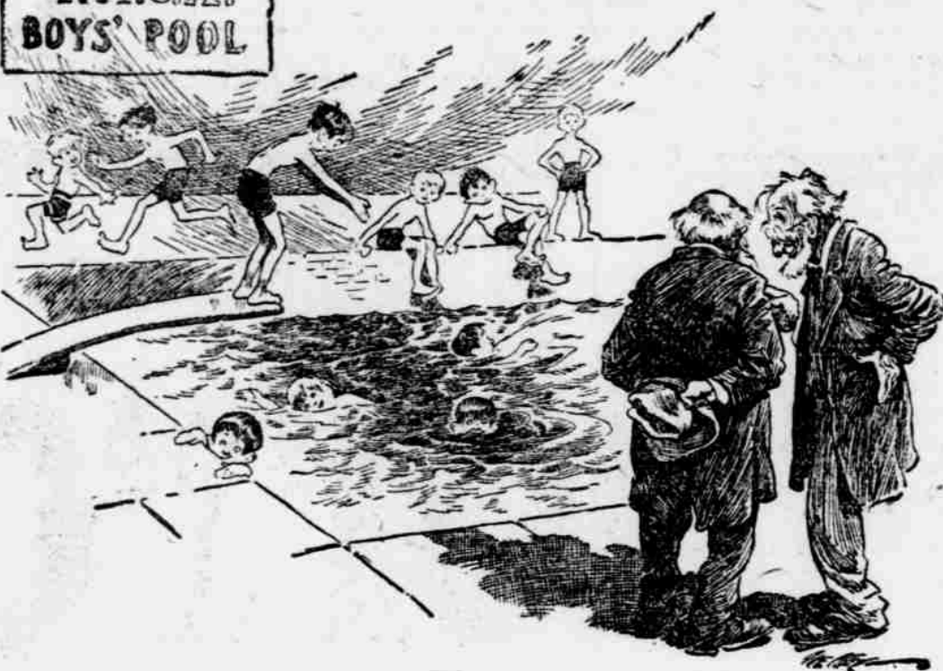
"Give our old swimmin' hole wasn't in it!"