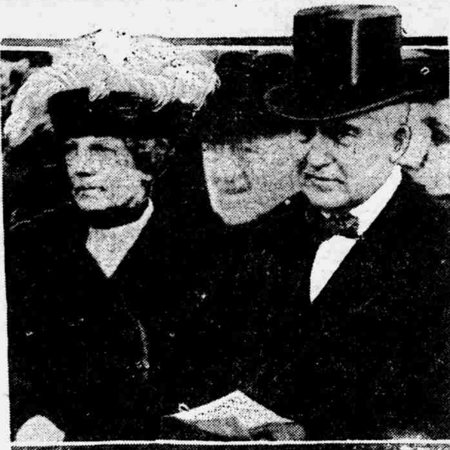
President-elect and Mrs. Harding.

This photo of President-elect Harding and Mrs. Harding taken just before they left St. Augustine, Fla., for the north, is one of the few, if not the first, taken of Harding in a silk hat.