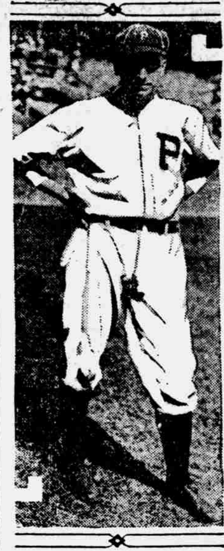
Epps Jephtha Rixey.