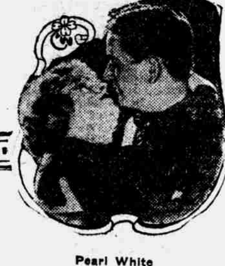
Pearl White MURRETTE