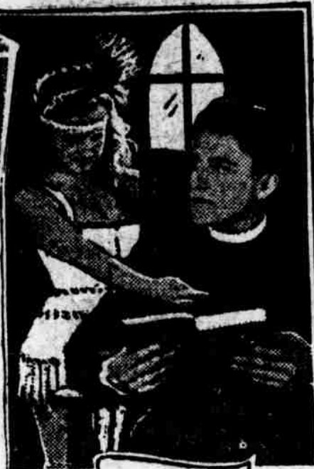
Gladys Walton and Jack Perrin in "PINK TIGHTS" UNIVERSAL