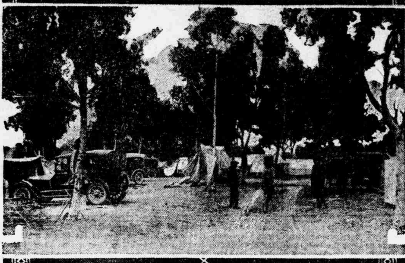
Glimpse of part of the municipal camping grounds at San Diego.

For the benefit of tourists who have heretofore found it difficult to find a place to stop while in San Diego, Cal., officials of that city have set aside a large open space for a municipal camping ground. There tourists can pitch their tents or halt their portable houses without charge.