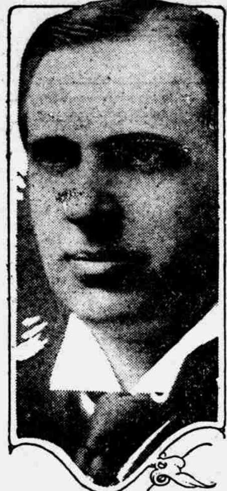
Rep. Daniel R. Anthony.

Rep. Daniel R. Anthony, Republican, of Kansas, in charge of the army bill before the new committee of the house, characterizes as "preposterous" the request of the war department for approximately $600,000,000.