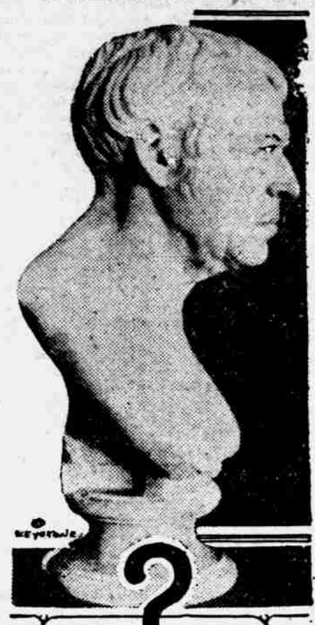
The uncatalogued bust of President Zachary Taylor.

Among the many famous statues and works of art in the capitol building at Washington, D. C., is a marble bust of President Zachary Taylor. It is uncatalogued and of unknown origin. There seems to be no record of how the statue came to be placed in the capitol.