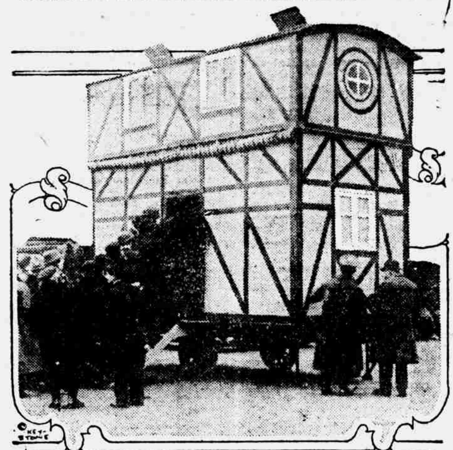
Model of portable house on auto truck exhibited in street in Paris.

What may be a solution of France's acute housing problem as she rebuilds her devastated areas is seen in the suggestion of the minister of reconstruction who urges the building of durable portable houses. These houses, though small, would meet the needs of the average family until they acquire the means to build better dwellings. The portable houses could be built in factories and moved by motor truck to their destinations.