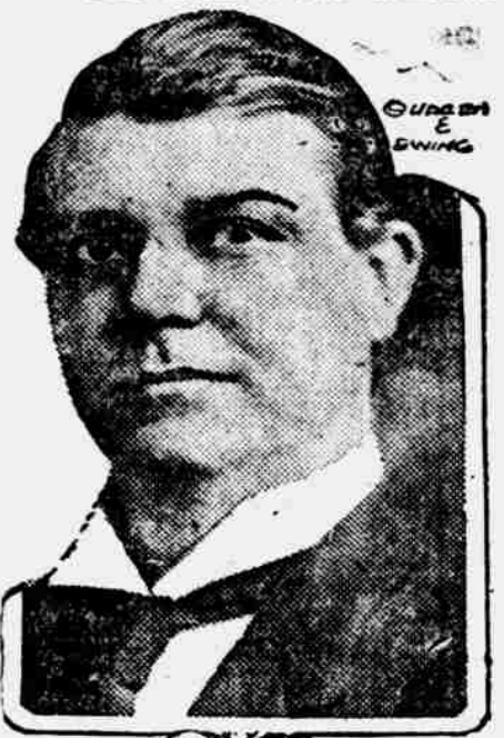
Rep. Claude Kitchin.

Representative Claude Kitchin is to withdraw as head of the minority or the house ways and means committee and become floor leader for the Democrats in the incoming congress, succeeding Champ Clark. At least this is the report from Washington. The Dams, it is said, are already planning their organization after March 4.