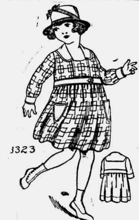
A COMFORTABLE DRESS FOR MOTHER'S GIRL.