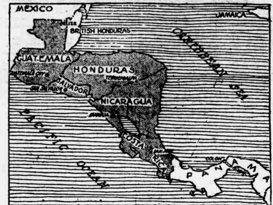
The five Central American republics.

The prospect of organizing the union of Central America, to be composed, as originally, of the five Central American republics, is reported to be better now than ever before since the dissolution of the former union. The work of arranging preliminaries for a convention of representatives of the five republics is being carried on under the direction of Salvador.