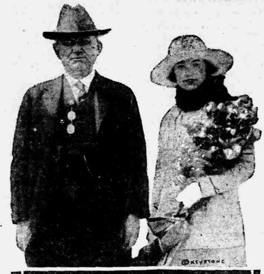
Gov. A. H. Roberts and daughter.

Because he outmaneuvered them at every turn, Tennessee anti-suffragists are out for the political scalp of Gov. A. H. Roberts, leader of the suffrage forces in that state. But the governor isn't worrying. He counts upon the support of the enfranchised women of the state as well as the Tennessee men who favor equal suffrage.