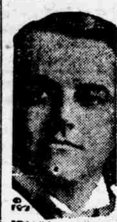
FRANK B. WILLIS

A big fight is on in Ohio for the seat in the United States senate which Senator Harding will vacate on March 4 next. The Republican nominee for the place is former Governor Frank B. Willis.