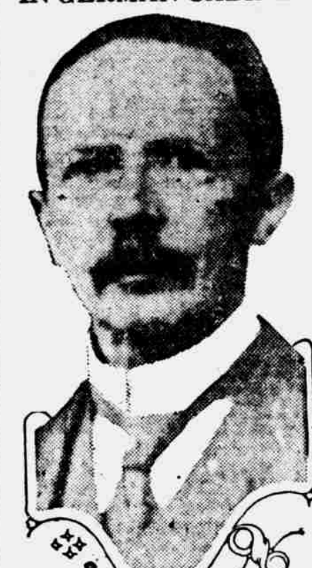
Dr. Walter Simons.

Dr. Simons holds the none too easy job of foreign minister in the German cabinet. In his dealings with the allied countries he almost invariably comes off second best. Dr. Simons was one of the German delegates to the recent conference at Spa, where this photograph was taken.