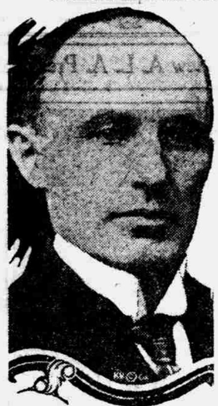
Hon. Arthur Meighen.

Hon. Arthur Meighen, formerly minister of the interior in the Canadian cabinet, has just been appointed prime minister to succeed Sir Robert Borden, resigned. Only forty-six years old, Meighen is the youngest man to be called to the Canadian premiership. He was born in Perth county, Ontario, and has held many important positions in the government service.