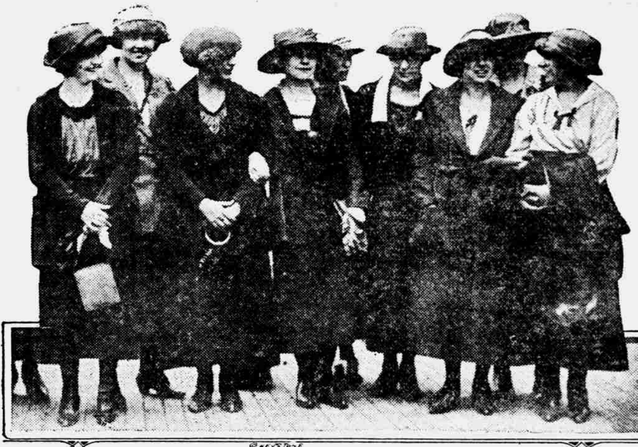
The girls, photographed just before sailing from New York. This group of university girls of Kentucky is now bound for France, where they will visit the battlefields. They are paying their own expenses and will return early in the fall.