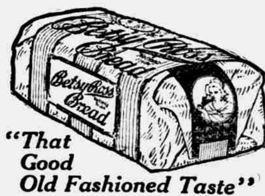
"That Good Old Fashioned Taste"

Little savings run into big totals—so buy Betsy Ross Bread, made only in the large size.