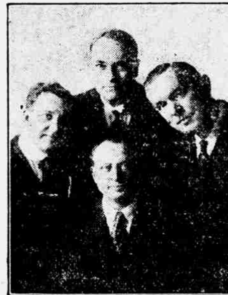
Columbia Stellar Quartette

Tickets on sale by all public school teachers, $1.10 including war tax. Plat now open at WEISBROD MUSIC CO.