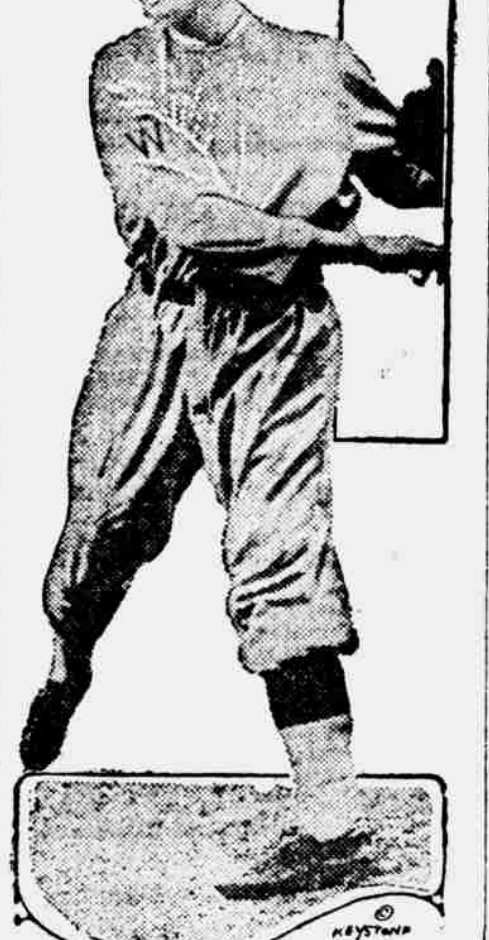
Walter Johnson, snapped limbering up at Nationals camp.

Down at Miami, Clark Griffith's team is getting in shape for the coming drive and the center of interest to the Miami folk and visitors is Walter Johnson. And judging from his present condition and the way in which his arm is working, he is ready for another good year.