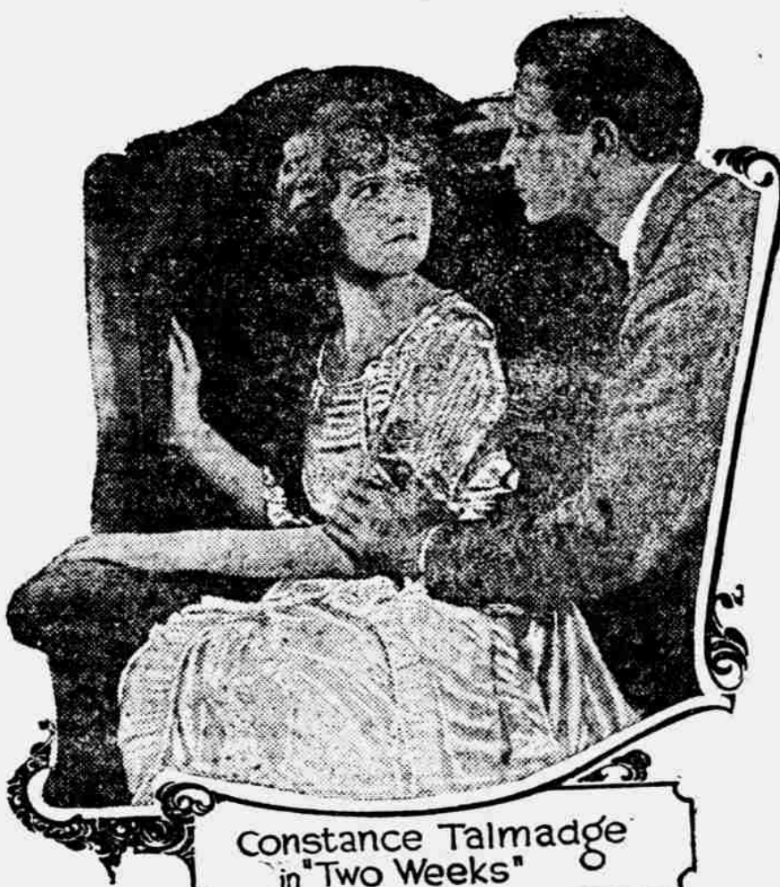
Constance Talmadge in "Two Weeks"

In her latest and best picture. She ruined the lake and won the hearts of three bachelors