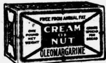
Cream of Nut Margarine A pure, rich vegetable product. The cream of nut butter.