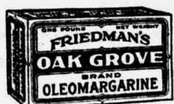
Oak Grove Margarine The original margarine—government inspected.