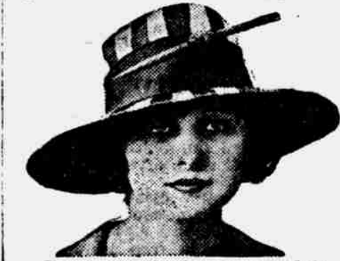
You Positively Cannot Afford to Ignore These Remarkable Pyramids.

You are suffering dreadfully with itching, bleeding, protruding piles or hemorrhoids. Now, go over