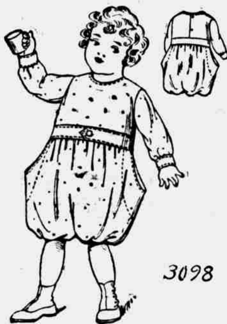
A COMFORTABLE PLAY GARMENT

The World's Largest Shoe Dealers 18 Stores 724 Main Street