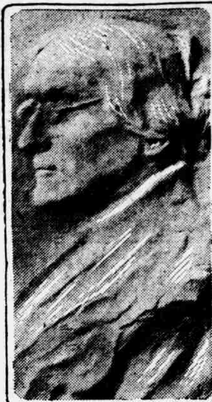
Photo of a bas relief of Susan B. Anthony.

Suffragists have hopes that the prophesy made by Susan B. Anthony years ago that "American women will have suffrage in 1920" will come true. Ratification by seven more states will accomplish this. Suffragists are planning to observe the centennial of her birth, which occurs February 15.