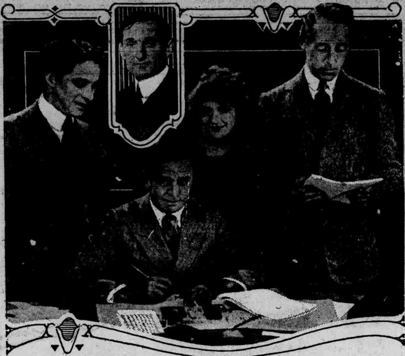
Left to right: Charlie Chaplin, W. G. McAdoo, Mary Pickford, D. W. Griffith, and Douglas Fairbanks, seated.

Four of the biggest stars in the photoplay world have joined together in the biggest organization in film and this photograph shows them signing the papers. This combination has been rumored for some time and now it is an established fact. The name of the organization is the United Artists Corporation.