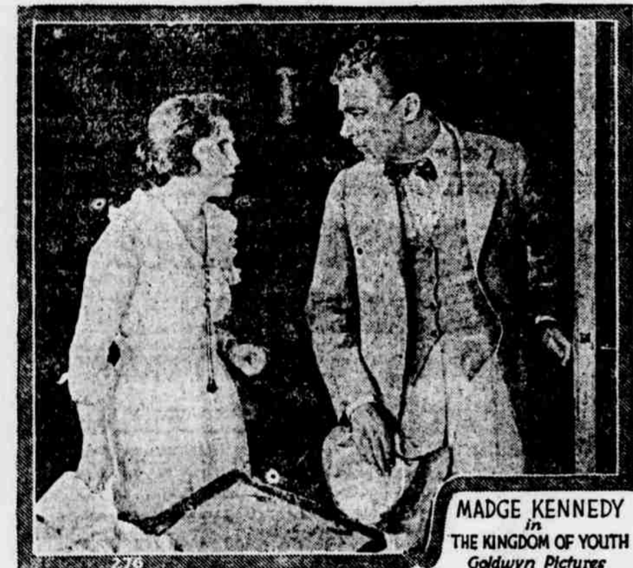
MADGE KENNEDY in THE KINGDOM OF YOUTH Goldwyn Pictures