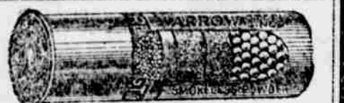
Gun Shells ..... 79c Box BIRCK'S HARNES STORE, 509 Main