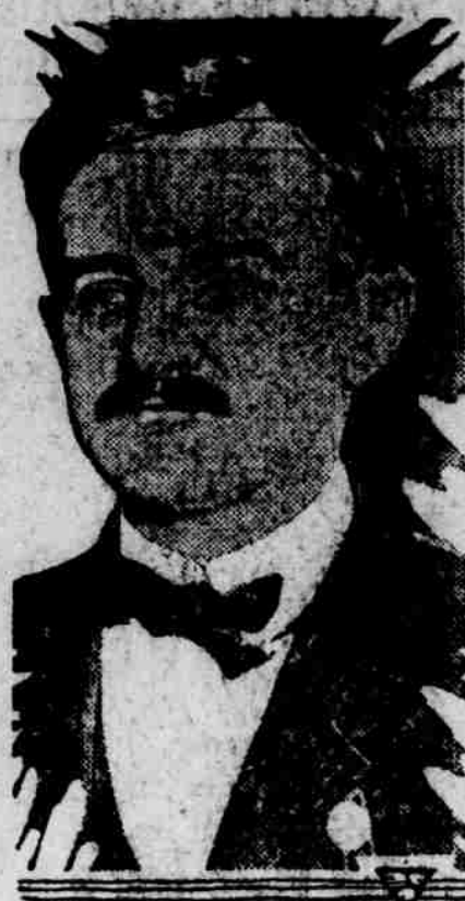
Mayor Daniel W. Hoan.

boys in France are now organizing to assure vigorous prosecution of the war, and I say solemnly that these men are of the quiet and determined character which will not stand for a Socialist government in Milwaukee or the state of Wisconsin. We are prepared to act. We will, for instance, act if we do not get martial law or an indictment which will prevent Hoan from being sworn in again as mayor. I hope that it will not be up to our organization—we call it so far 'the next of kin'—but if it is necessary we will not falter."