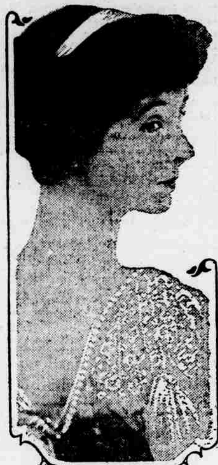
Duchess of Marlborough.

LONDON, Jan. 8.—The Duchess of Marlborough, who was Consuela Vanderbilt, has made a gift to the children's jewel fund of a magnificent collar, built of fifteen rows of the famous Vanderbilt pearls, connected by large diamonds and set in plaques. It is valued at $25,000.