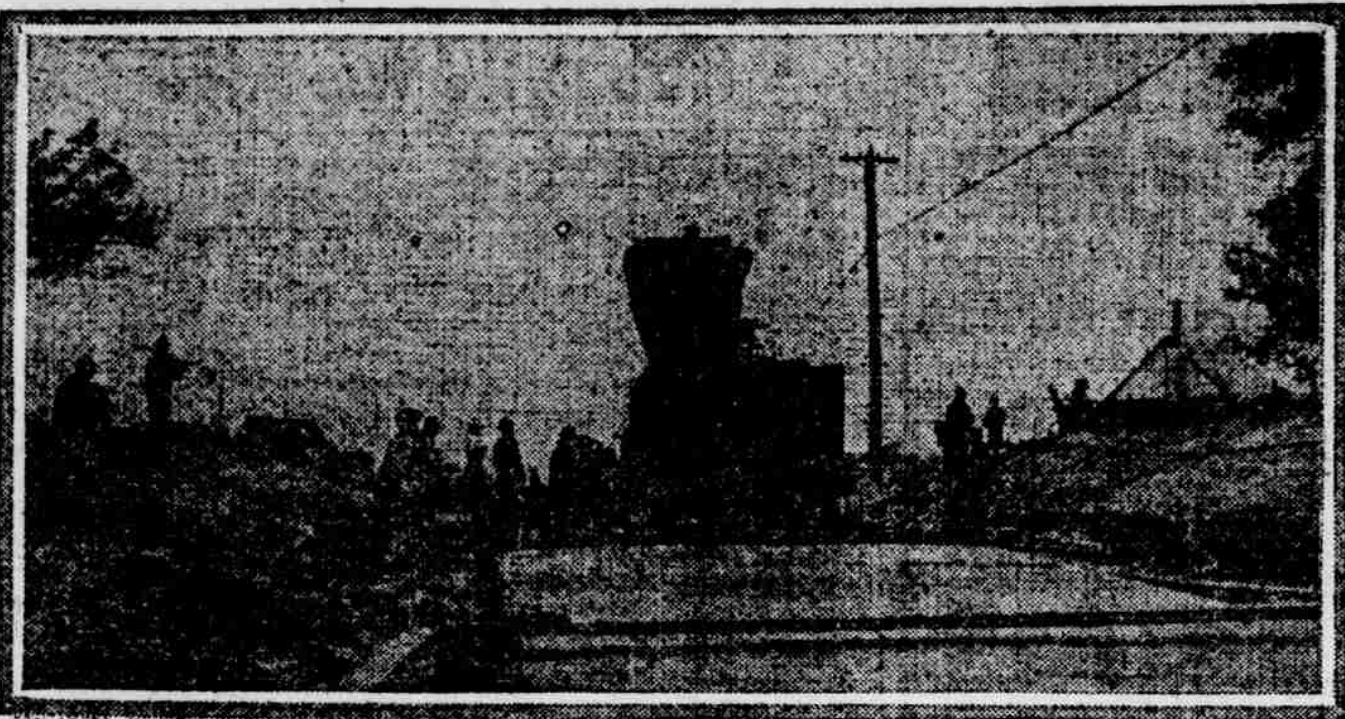
ROAD-BUILDING CAMP LEADS New roads are being built with marvelous rapidity through the undeveloped ground which is being converted into Camp Leads, where the Pennsylvania drafted men will be roadway being constructed by one of the marvelous road-building machines.