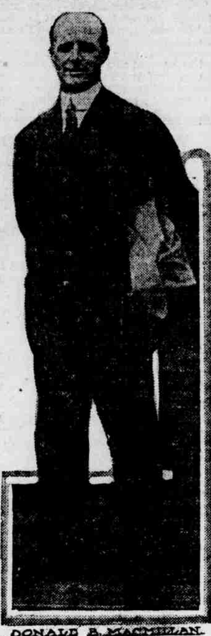
DONALD B. MACMILLAN

Donald B. MacMillan, the Arctic explorer, photographed on his arrival in New York. Mr. MacMillan was the commander of the American Museum of Natural History's expedition, which discovered that "Crocker Land," reported by Rear Admiral Peary, was a mirage and did not exist in reality. Mr. MacMillan says that the day of dogs and sledges in Arctic exploration has passed, and that aeroplanes will be used in the future.