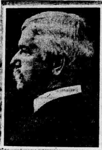
SURGEON-GEN. W. C. GORGAS.

Surgeon-General William C. Gorgas, U. S. A., the man who cleaned up the Isthmus of Panama and stamped out the fever in that place, as he had previously done in Havana, will be in direct charge of all of the Red Cross hospital units ordered abroad. Six face hospitals have already been ordered to make ready for service in France. These hospitals are the Cleveland, the Pennsylvania, the Evanston (Ill.), the St. Louis, the Harvard and the New York units.