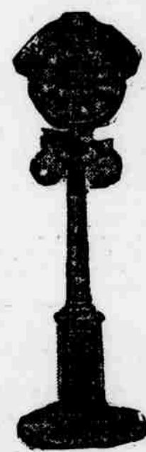
At the Big Clock