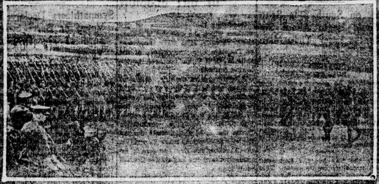
(Above) A great howitzer under its "parasol" a platform covered with foliage which deceives the enemy air observers. In the first two years of the war the Germans had a superiority of great guns, but now the Allies boast the upper hand in this respect. Their giant missiles have battered in the Germans' first and second line defenses. (Below) King George of England reviewing great masses of troops in France just before they entered the maelstrom of death a few miles away.