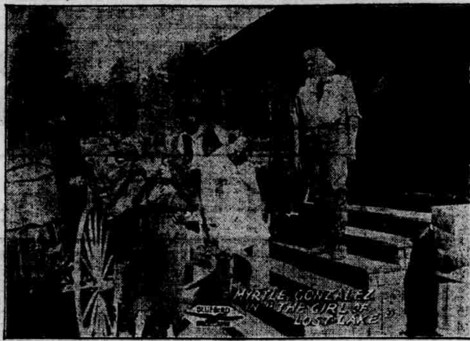
Scene from "The Girl of Lost Lake" at the Washington Sunday and Monday

p. m. Evangelistic services at 7:30 p. m. Prayer meeting Tuesday evening at 7:30. Ladies' Aid society Wednesday at 1:00 p. m. Teachers training class Wednesday evening at 7:30. Cottage prayer meeting Friday evening at 7:30.