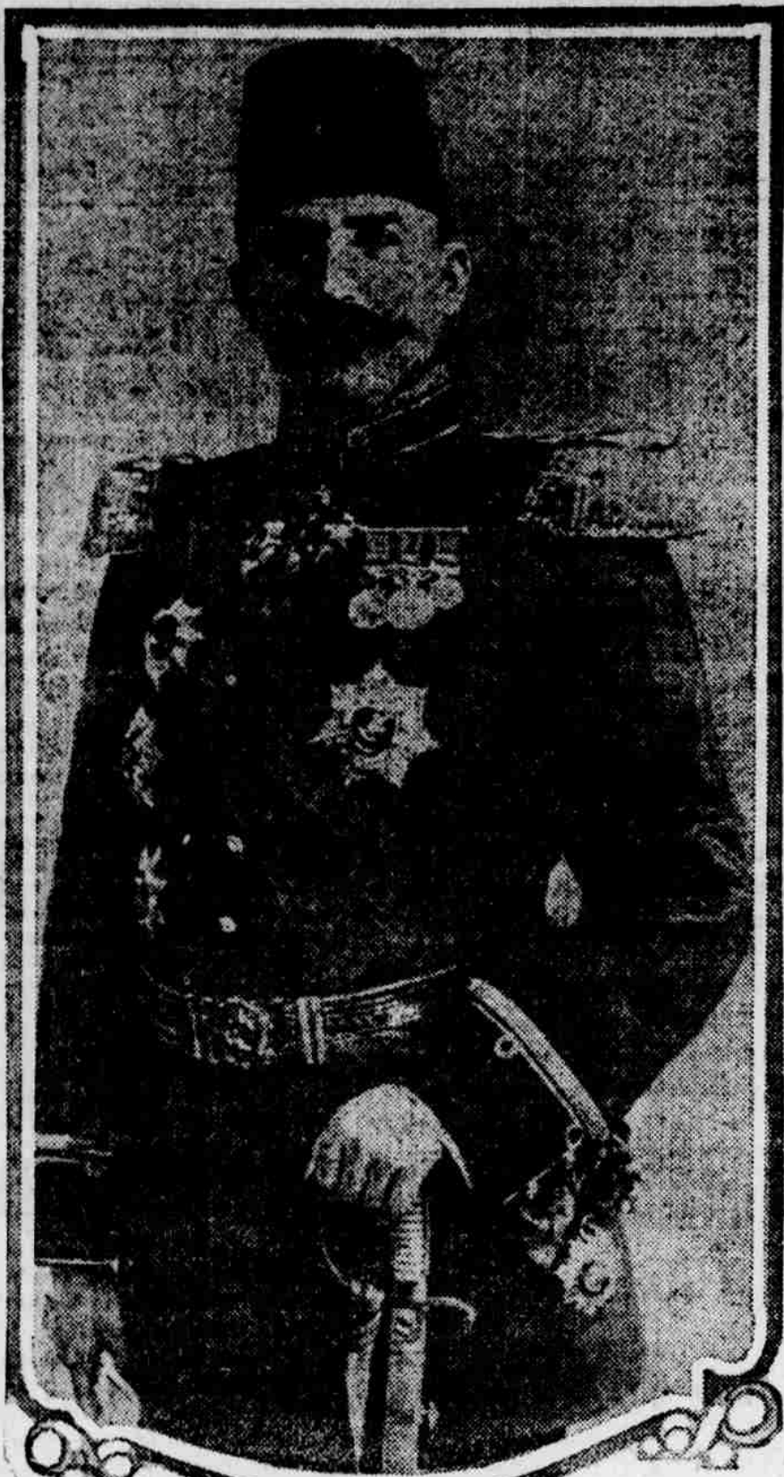
ESSAD - PACHA

A report is current in London that a Turkish court martial in Constantinople has passed the death sentence on Essad Pacha, formerly provisional president of Albania. He was charged with having conspired with hands against the Turkish Empire and with having declared war on Turkey. Essad Pacha was deprived of his rank in the Turkish army after he joined the Italians in Albania in January, 1916. He later went to Rome, and in March left Italy for Paris, where he was received by the Premier, Mr. Briand. He was sentenced to death at Constantinople in June, and in August was reported to be commanding an Albanian contingent which landed at Salonica.