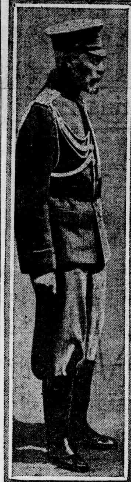
GRAND DUKE NICHOLAS

The Grand Duke Nicholas, uncle of the Czar is said to have left Trebizond in Turkey in Asia for Odessa, from which point he will go to the Dobruja battle front to take command of the Russian forces battling against the Turks, and endeavor to push his way through to Constantinople from the north.