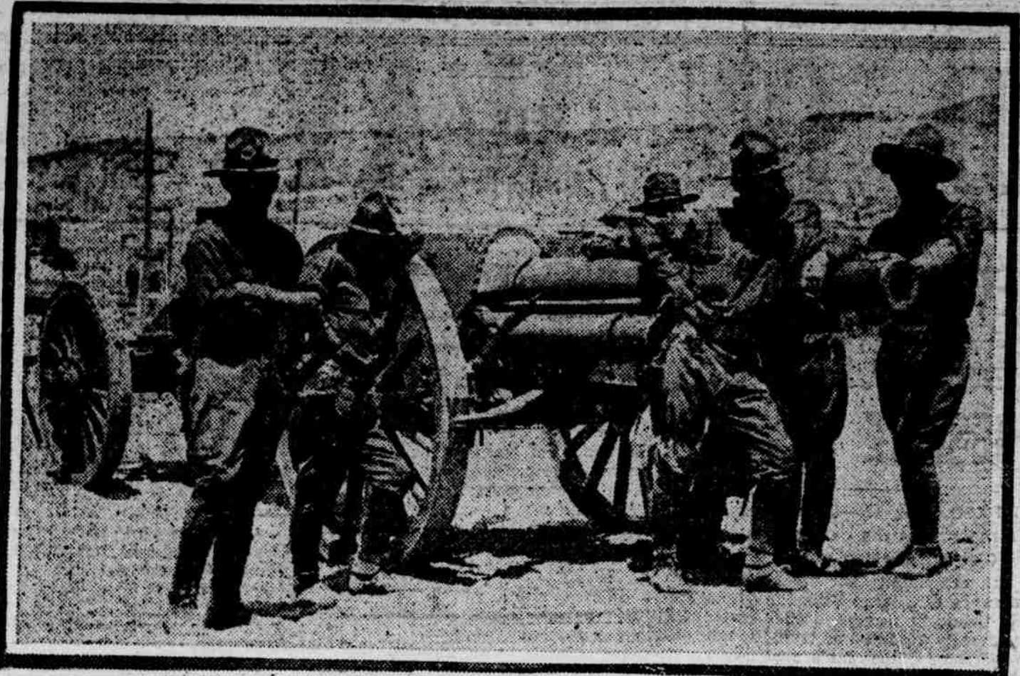
4.7 INCH GUN ON BORDER

This is a picture of one of the 4.7 inch guns of Battery C, Fifth United States Field Artillery. This gun is one of the many pointed toward the Mexican side of the border to remind our neighbors that Uncle Sam is prepared and ready.