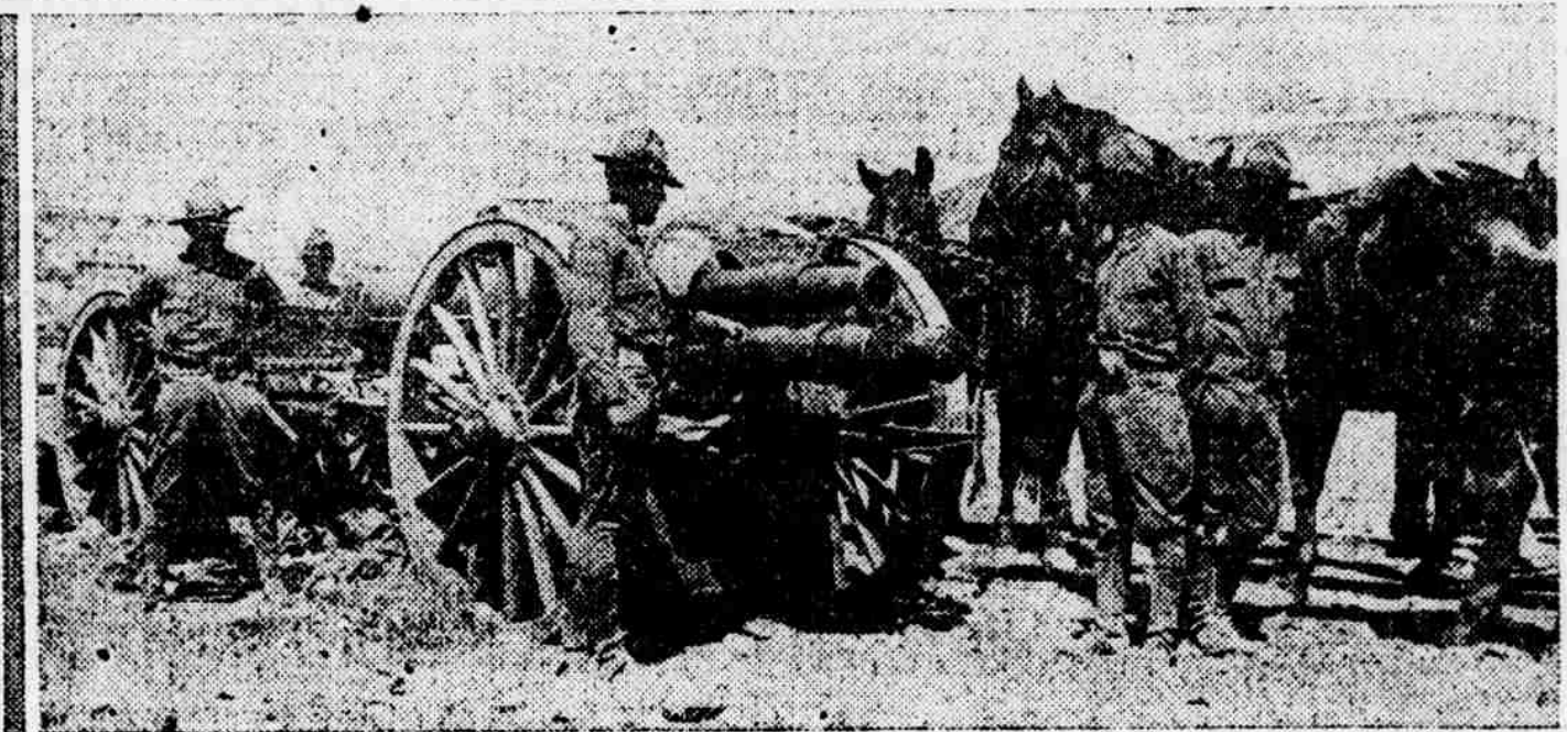
Here is the picture of one of the American 7.4-inch field guns, part of the equipment of Battery E, Fifth United States Infantry, at El Paso, which may be sent into Mexico.