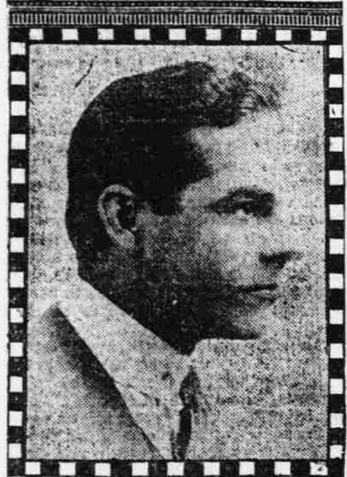
ANTONIO MORENO A Versatile Player whose Skill as Actor, Distinguished Bearing, Clear Cut Spanish Profile and Handsome Features Have Won Him Prominent Place Among Screen Favorites.