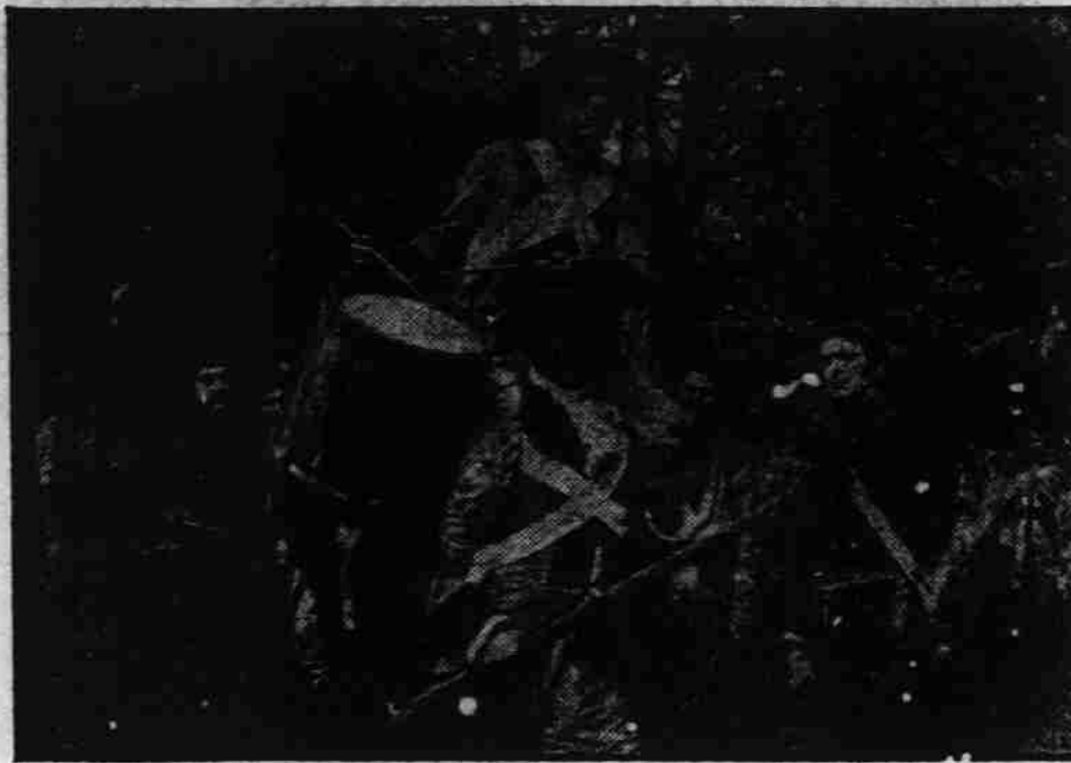
"INDIANA" CENTENNIAL FILM COMING.

The feature centennial historical motion picture film "INDIANA," to be shown in this city soon, is 7,000 feet long and covers a period of history of over 230 years, or from the advent of LaSalle to the present time. One of the scenes in the picture is that of the little drummer boy encouraging the soldiers under the leadership of George Rogers Clarke.