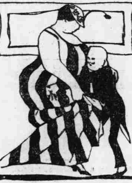
ON WITH THE DANCE.

"I'm awfully sorry I stepped on your foot. Did it hurt?" "Oh, no!" "Do you know Mr. Glide told me yesterday that I was very light on my feet?"