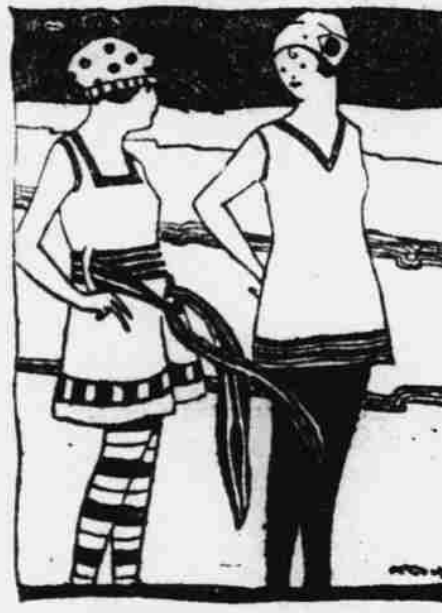
FOR LOVE OR MONEY.

The honeybee is very small. And doesn't make much showing. But leave it to him, one and all, To keep his end a-going.