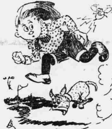
THE BUSINESS BEE.

"I'm awfully sorry I stepped on your foot. Did it hurt?" "Oh, no!" "Do you know Mr. Glide told me yesterday that I was very light on my feet?"