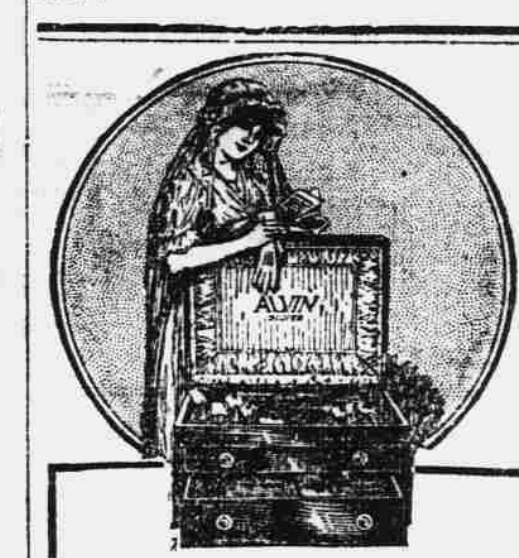
Win the Big Prize