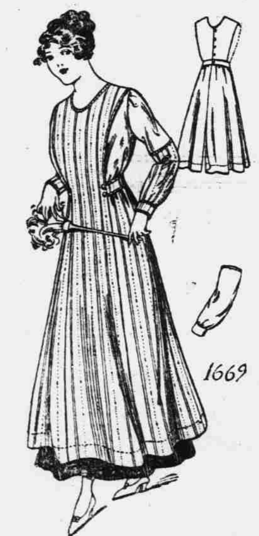
1669—Ladies' Apron and Sleeve Protector.

This model has several good features. It is made with a waist portion over the back, which joins the skirt at the belt, and so holds the apron snug and trim in place. The sleeve protector is most serviceable, covering that portion of the dress or waist sleeve which is most easily soiled.