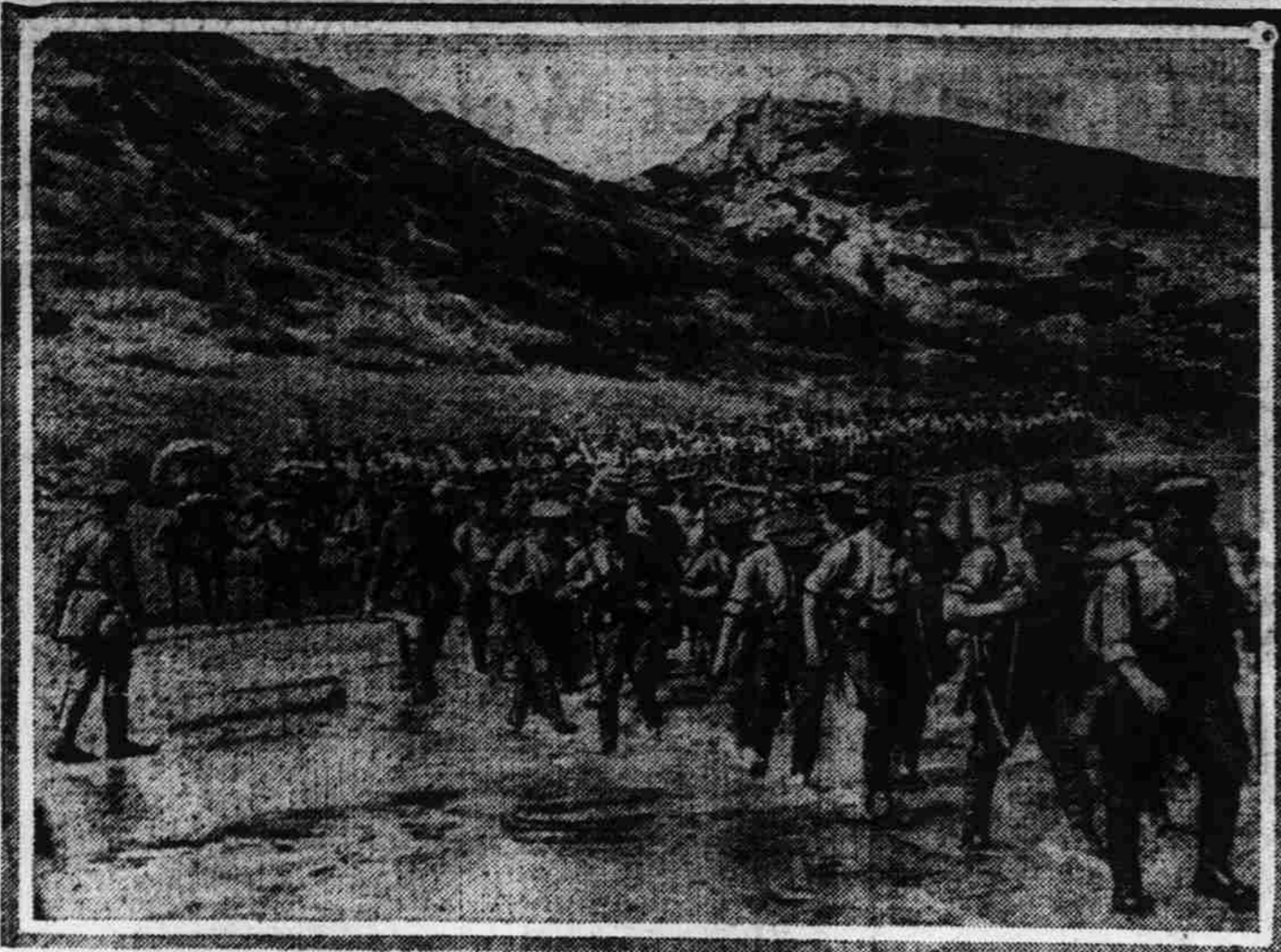
BRITISH ON THE MARCH IN THE BALKANS.

The allied forces in Salonika are being moved to the Balkan front where the Bulgarians and Germans are being concentrated in great numbers. From all indications the movement portends that the long expected drive on Salonika is about to be started. The photograph shows British infantry crossing one of the many streams en route to their new positions on the Balkan front.