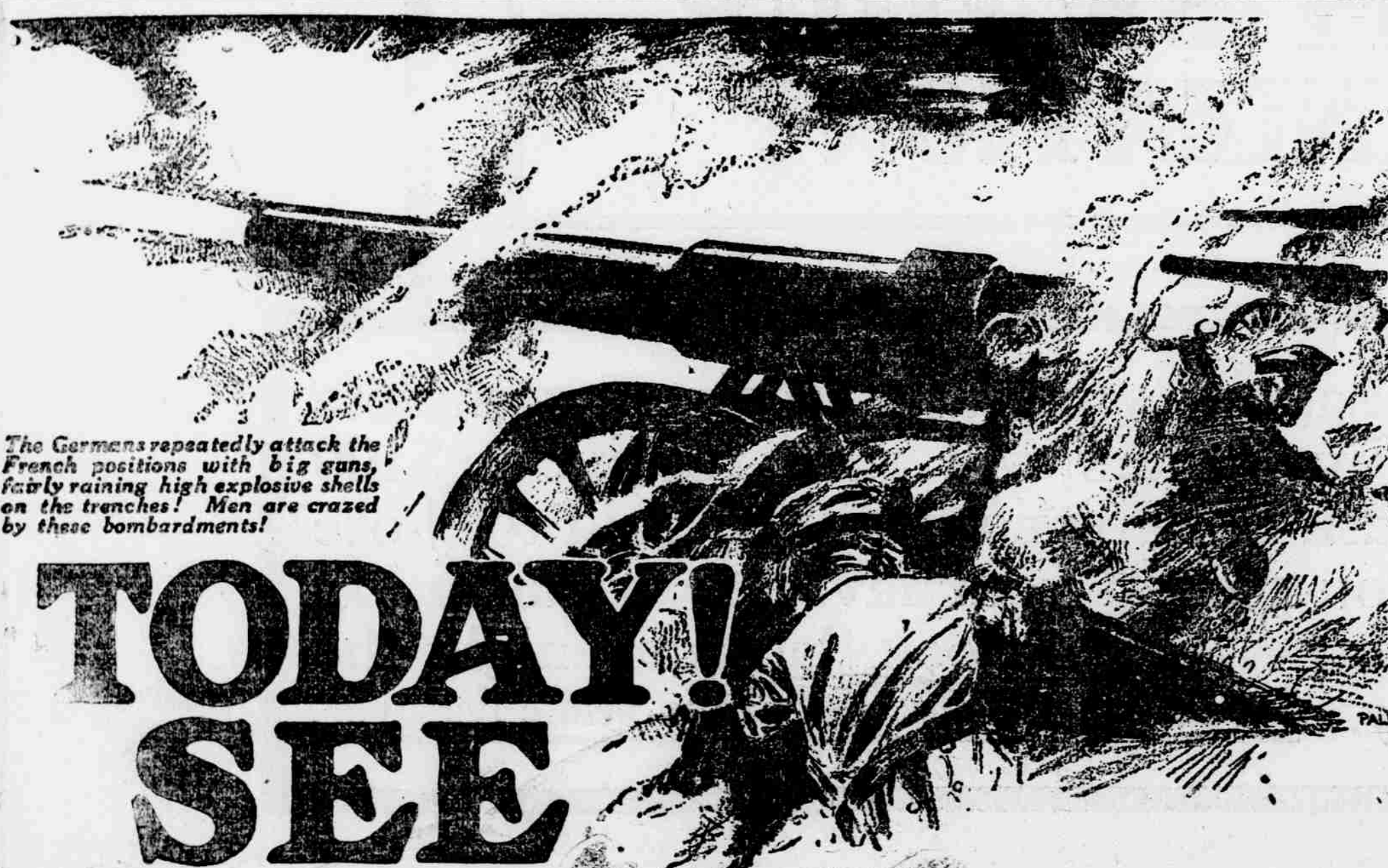
The Germans repeatedly attack the French positions with big guns, fairly raining high explosive shells on the trenches! Men are crazed by these bombardments!