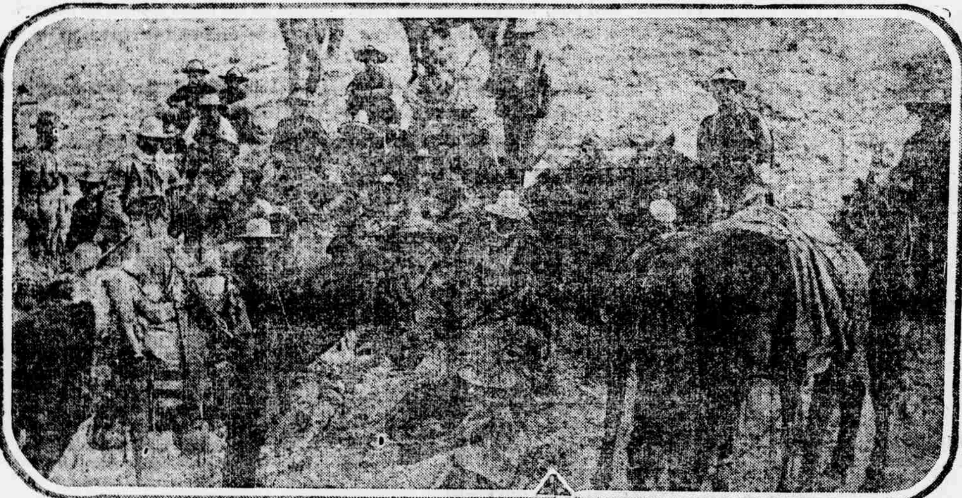
VILLA AND HIS STAFF.

Francisco Villa and his staff, resting after a hard, long dash over the plains of Mexico on one of his recent raids. Arrow points to Villa. His horse is the one on the right.